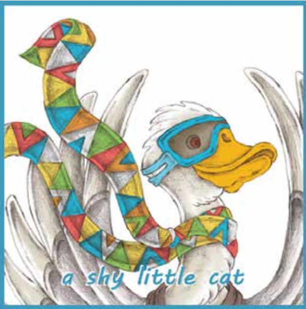
a shy little cat