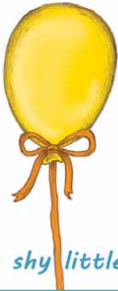
a shy little cat