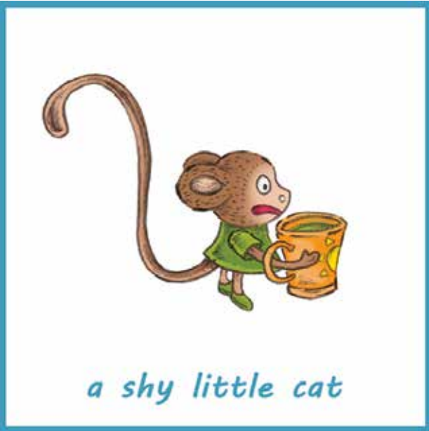
a shy little cat