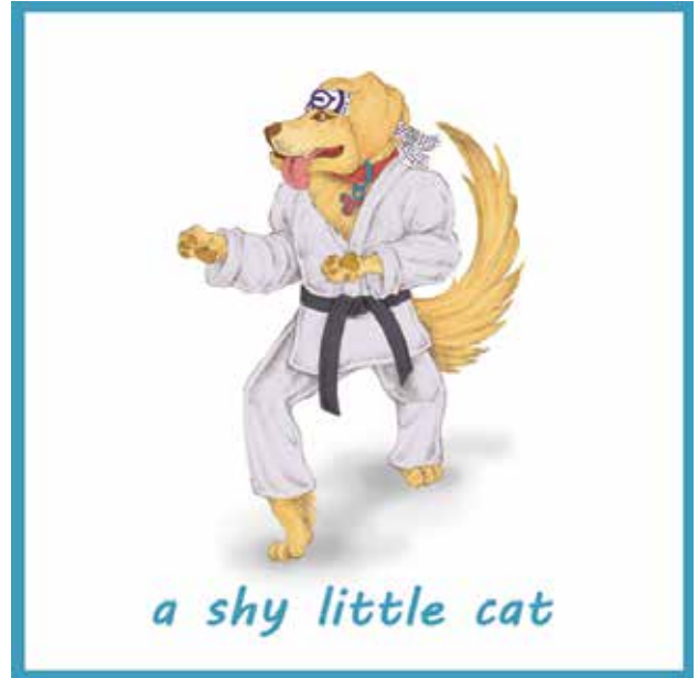
a shy little cat