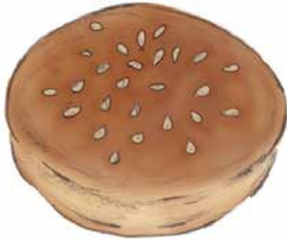
a shy little cat