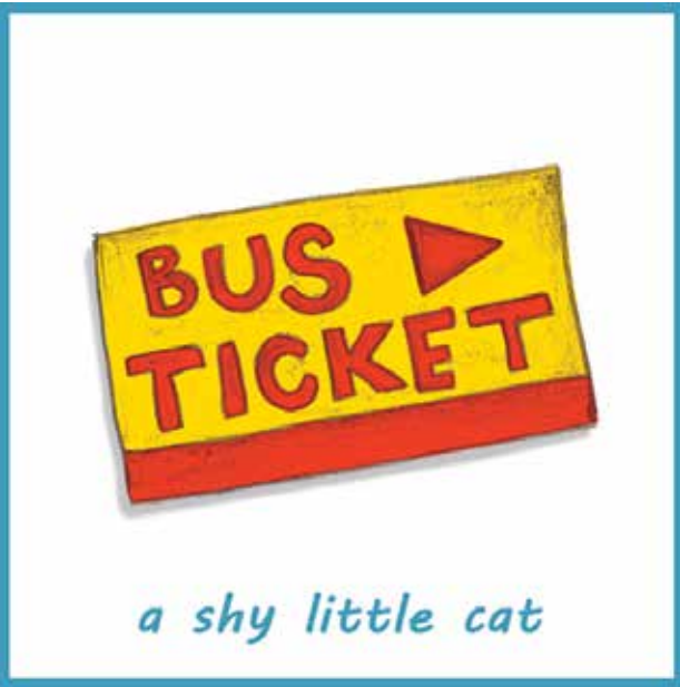
a shy little cat