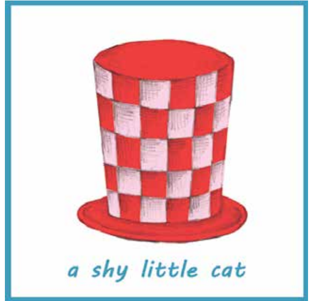
a shy little cat