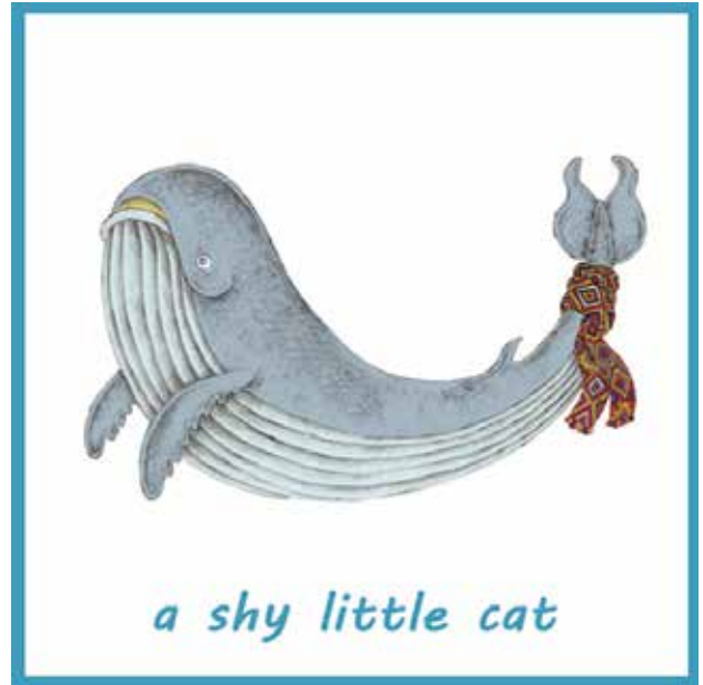
a shy little cat