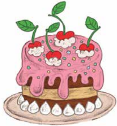
a shy little cat