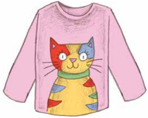
a shy little cat